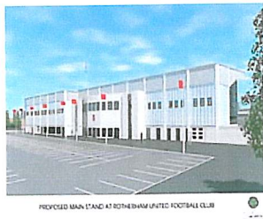
PROPOSED MAIN STAND AT ROTHERHAM UNITED FOOTBALL CLUB